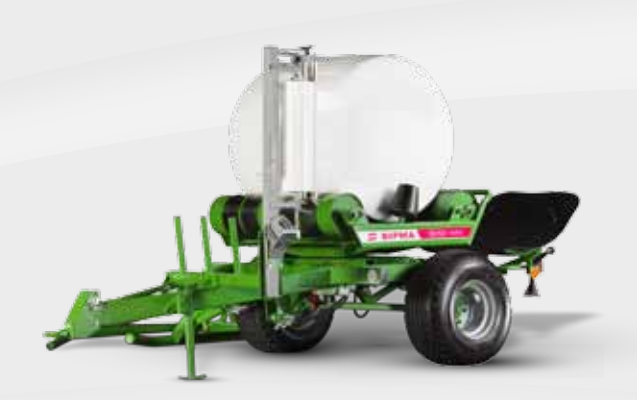
SIPMA OS 7521 MIRA

SIPMA OS 7521 MIRA bale wrapper is fully automated self-loading machine, attached to the tractor. Full automation of the process is provided by an advanced control system which allows pre-programming a wrapping cycle.