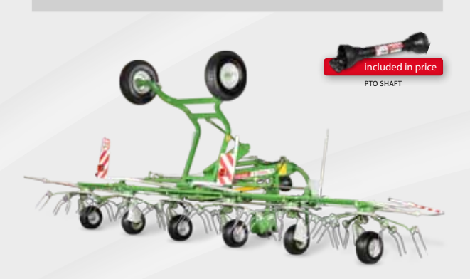
SIPMA PT 675 SALSA

Trailed tedders SIPMA PT 525 SALSA and SIPMA PT 675 SALSA are characterized by high efficiency. Machines guarantee optimal and equal spread of mowed material. Dedicated to work at small and medium farm with tractors with low power and low lifting capacity. Lowering the chassis to transport position is done by hydraulic cylinder.