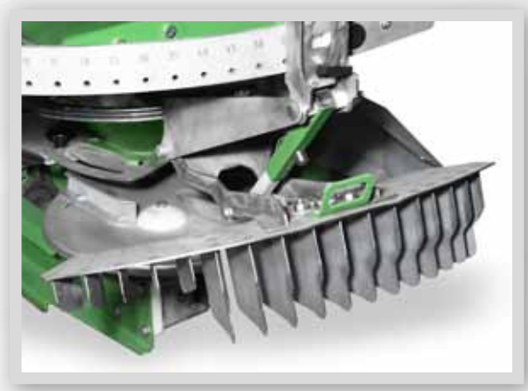
LIMES BORDER SPREADING SYSTEM

allows work to be carried out at field boundaries in accordance with fertiliser regulations, while ensuring that the correct application rate is delivered right up to the field boundary, and eliminates economic losses resulting from over-fertilisation or the spreading of fertiliser to neighbouring fields. Used when the first tramline lies in the middle of the spreader's working width. Made of stainless steel.