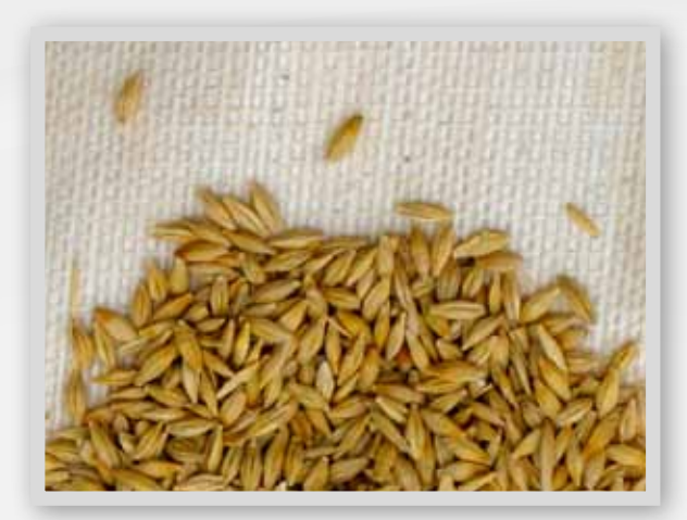
GRAIN BEFORE CRUSHING