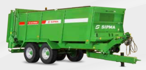
SIPMA RO 1200 TORNADO

SIPMA RO 1200 TORNADO and SIPMA RO 1400 TORNADO manure spreaders are used for spreading manure, compost, peat, chicken manure and lime. Characterized by a solid design and large loading capacity.