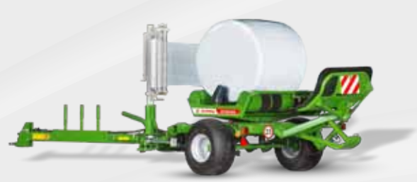
SIPMA OS 7650 GAJA

SIPMA OS 7530 MAJA SIPMA OS 7531 MAJA SIPMA OS 7650 GAJA SIPMA OR 7532 DIANA SIPMA OG 9750 I FNA