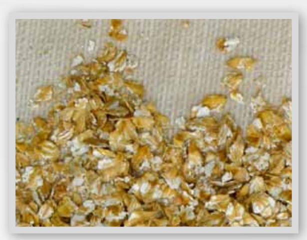
GRAIN AFTER THE USE OF SIPMA GRAIN CRUSHER