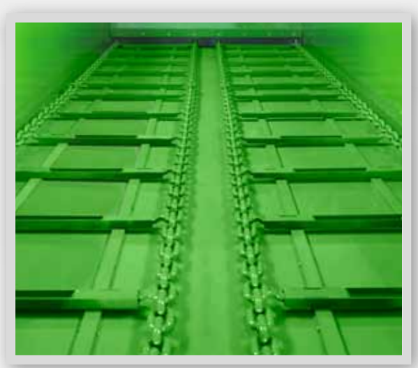
DOUBLE FLOOR CONVEYOR

allows to look into the load box safely.