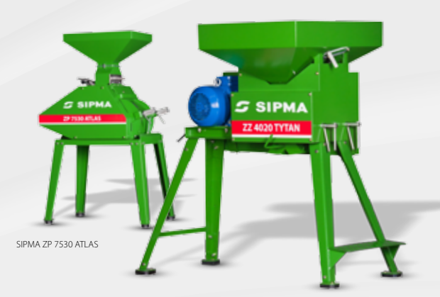
SIPMA ZZ 4020 TYTAN

SIPMA ZZ 4020 TYTAN SIPMA ZZ 7520 TYTAN SIPMA ZZ 7530 TYTAN