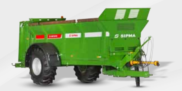
SIPMA RO 1000 TAJFUN