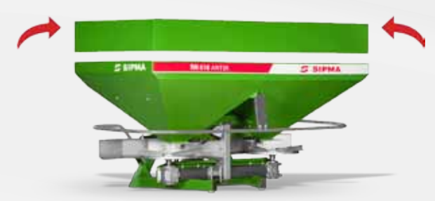
SIPMA RN 610 ANTEK WITH EXTENSION

are easily mounted on the main hopper and allow the hopper capacity to be adjusted as required, making the spreader suitable for use on both small and large areas. Simple assembly to the basket, bolted construction which saves transport space and reduces shipping costs.