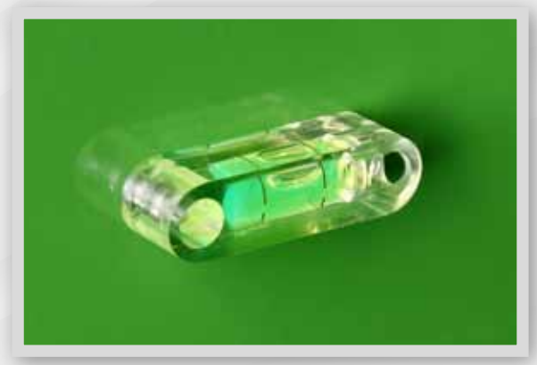
MACHINE TILT INDICATOR

help to position the spreader in the correct position in relation to the ground.